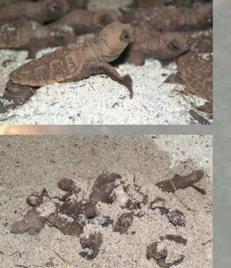
Once ready, the hatchlings emerge in group, usually at night and head towards the sea

It takes about 60 days for eggs to hatch and two or more days for the hatchlings to get to the surface.