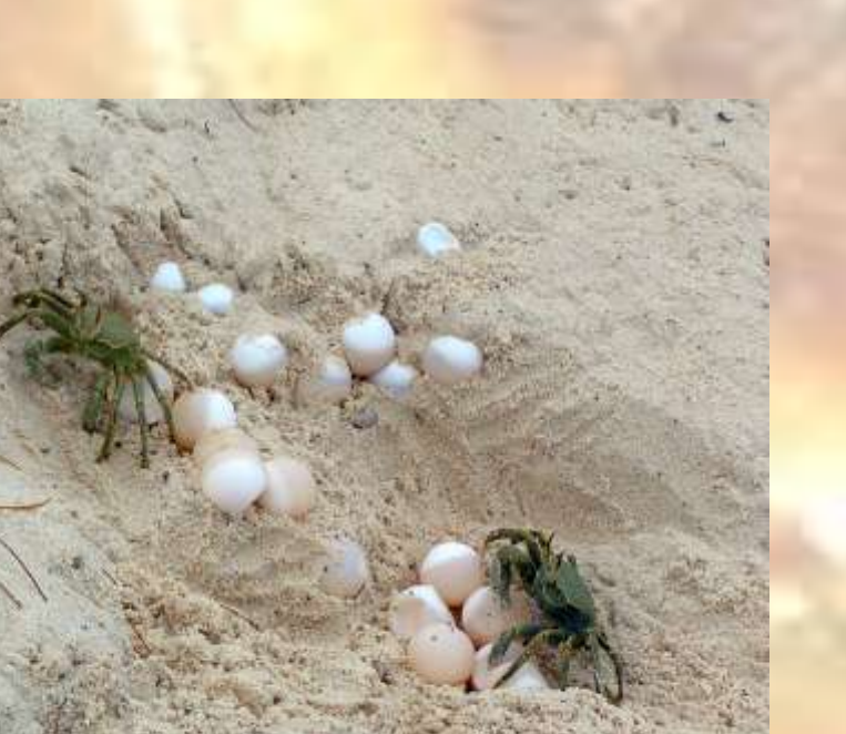
Ghost crabs eating turtle eggs washed away by waves