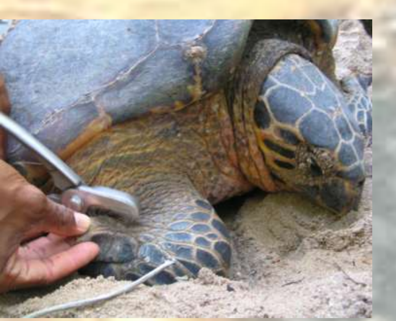
Tagging is one of many ways to monitor marine turtles